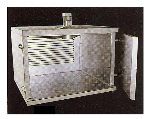
Autoclaves & Ovens