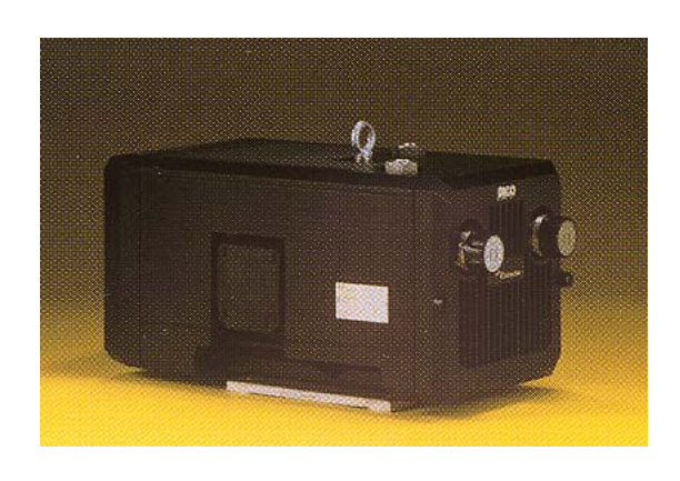
Vacuum Pumps & Systems