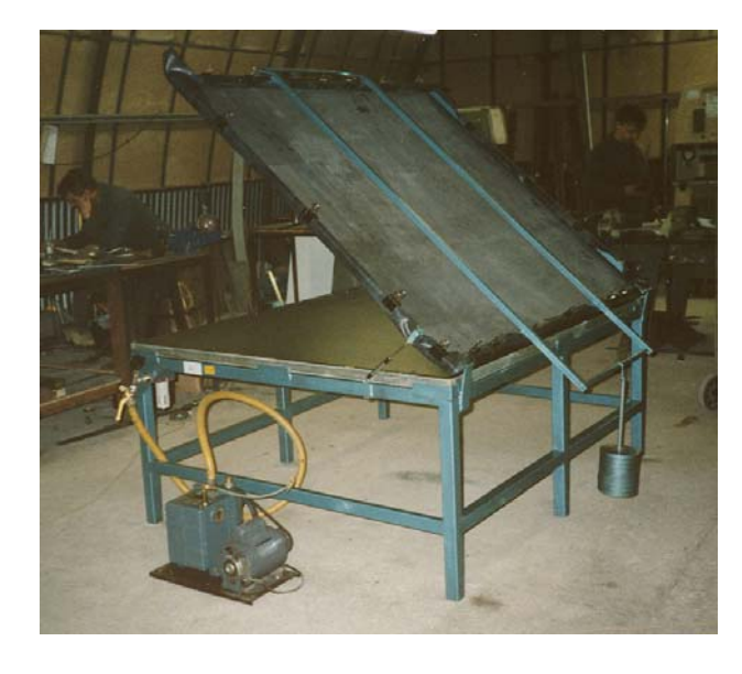
Presses & Pressure Bag Systems